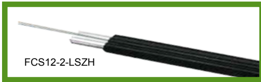
Bow-type drop Cable,single mode,simplex